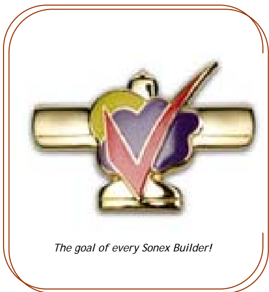
The goal of every Sonex Builder!